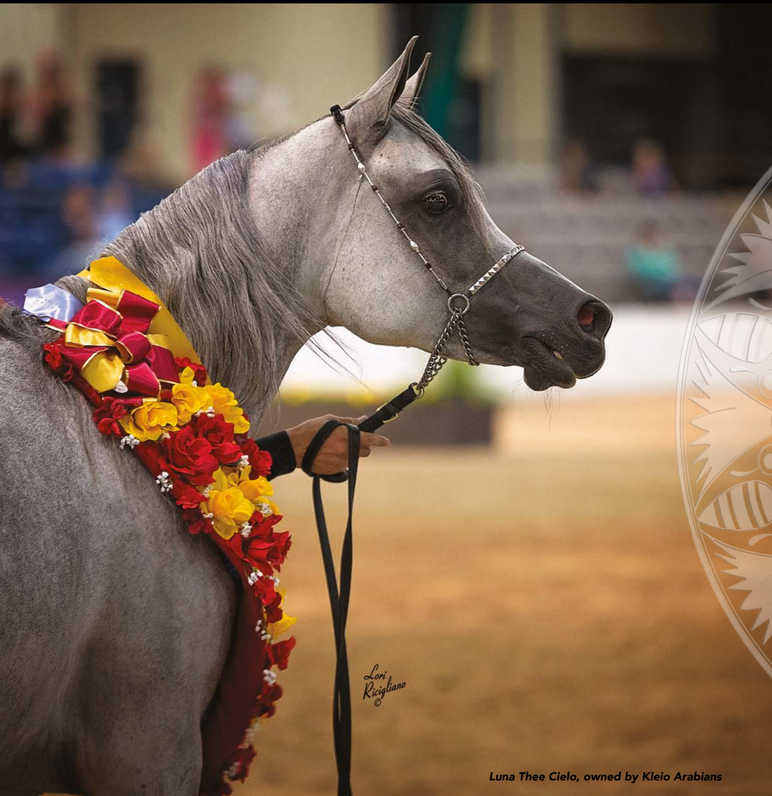
Luna Thee Cielo, owned by Kleio Arabians